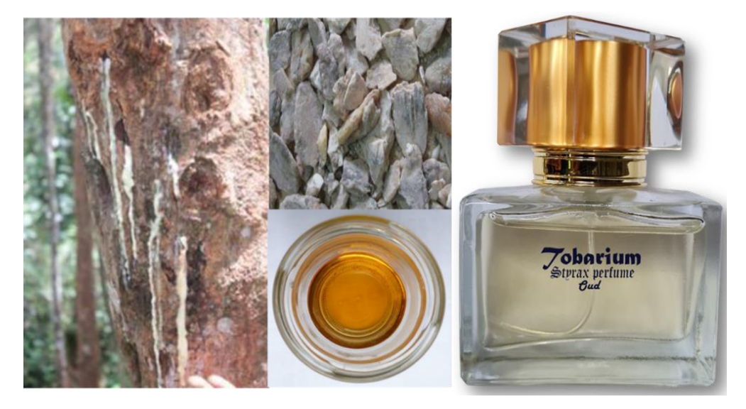
Figure 2. Resin processing and product innovation of benzoin.

Sumatran benzoin has mainly used for incense purposes [134] in the past. Recently, it has been expanded to be utilized in the fragrance industry (Figure 2) as a fixative agent for anti-aging purposes, and as food flavoring [129]. Benzoin oil is also processed into a perfume base-note [89]. Furthermore, benzoin has also been employed as a hair growth and blackening agent. It also has medicinal properties to reduce fever, relieve itching on the skin, and can be used as a liniment or massage oil [105]. The highest price of raw resin at local traders reaches IDR 250,000–290,000/kg for the highest grade and IDR 50,000 to 75,000 for the lowest grades. The benzoin oil resulting from the distillation process has a higher economic value, ranging from IDR 5 to 7 million/liter. The value-added can reach four times higher than that of the raw resin [89].