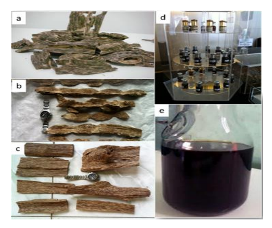
Figure 1. Aquilaria malaccensis Lam. tree (7 years old) can be harvested after three years. They are inoculated by Fusarium solani (Mart.) Sacc., producing the main products of agarwood raw materials with different grades ( a – c ) and agarwood oil ( d , e ).

Sandalwood oil is employed largely as an astringent, sedative, coolant, and disinfectant in the bronchial and genitourinary tracts, as well as an expectorant, stimulant, and diuretic [147].