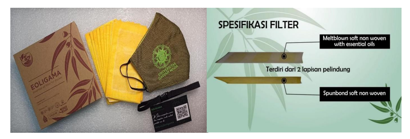
Figure 3. Cajuput essential oil filter for face mask.

One of the "ArthroSoothe" cream ingredients that can be used to moisturize the skin is cajuput oil. In Indonesia, cajuput cream is sold from IDR 9000–15,000 per pack. Cajuput oil has also been used in lotion products. Other product innovations are sucrose and non-sucrose cajuput candies, which have been produced since 1997 in Indonesia, to add the economic values of cajuput oil [180]. The candies are priced as much as IDR 70,000–125,000/kg. Cajuput candy inhibits Candida albicans and Streptococcus mutans during the development of dental caries [166].